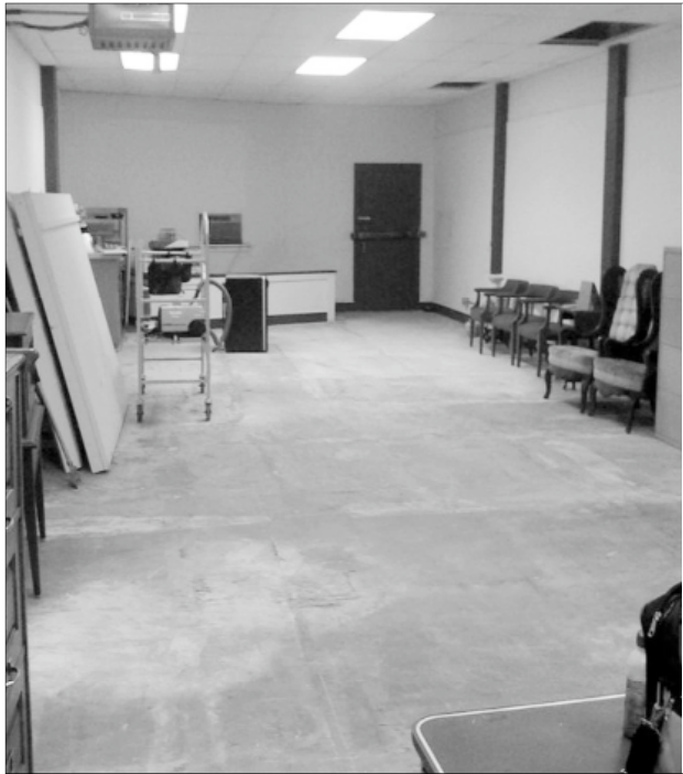
CLEAR Holistic Therapies, under construction